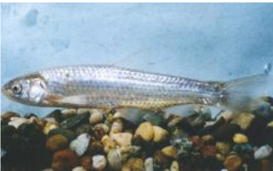
Photographs of Rio Grande cutthroat trout (top photo), Gila trout (middle photo), and Rio Grande silvery minnow (bottom photo)

As the drought continues, fish seem to be getting the worst of it. The drought is not just affecting the little minnow-sized fish, such as the Rio Grande silvery minnow and Pecos bluntnose shiner. It is affecting what most people recognize as real fish, the Gila Trout and Rio Grande cutthroat trout. There is not enough water, or water of sufficient quality, to support many of our native fish populations.